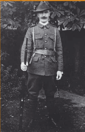
Michael 'The' O'Rahilly, a founder member of the Irish Volunteers, who was killed in action during the 1916 Rising.

the Volunteer Gazette DECEMBER, 1914 PRICE