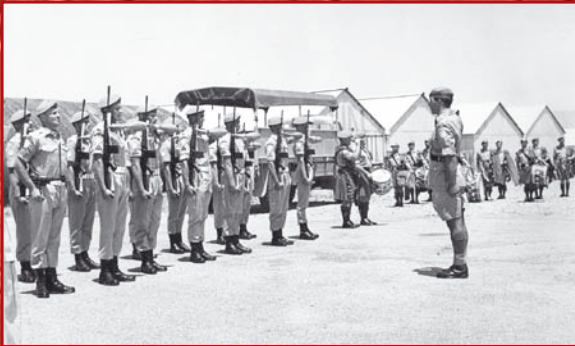
The 8 Infantry Group take over guard duties at UN Headquarters, Nicosia, Cyprus in 1967