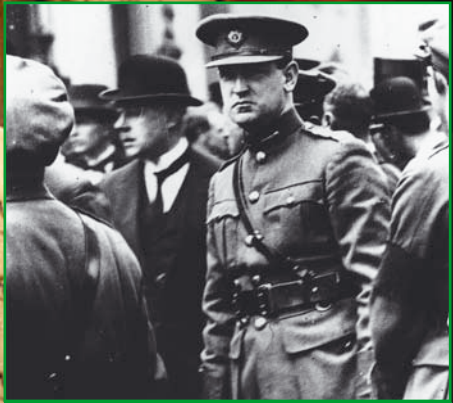
Michael Collins at the funeral of Arthur Griffith, August 1922.