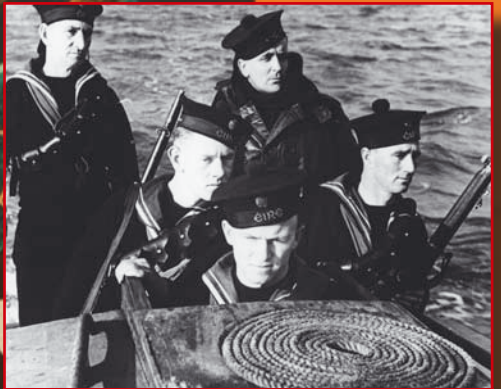
Members of the Marine Service on patrol