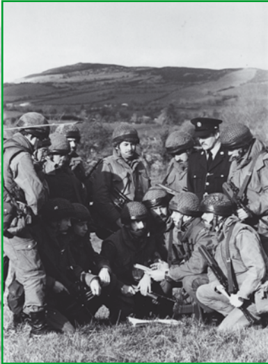
An Army/Garda Aid to the Civil Power exercise from the 1990s.