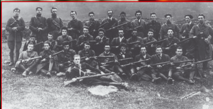
West Mayo Brigade Flying Column..