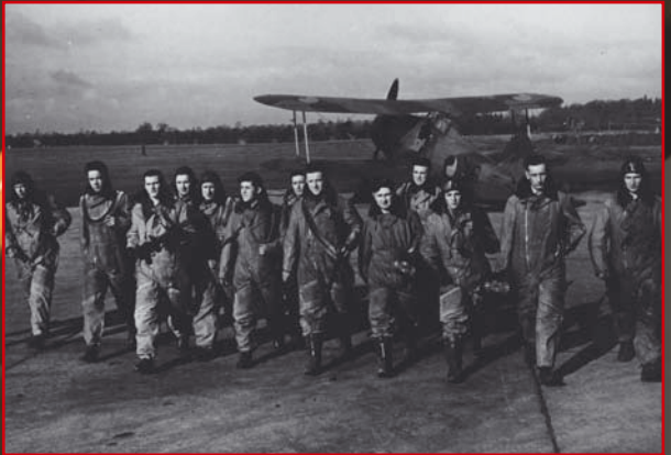
Air Corps gunners at Baldonnel.