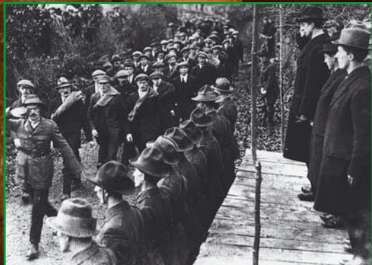
Eamon de Valera at a march past of Anti-Treaty forces in Clare.