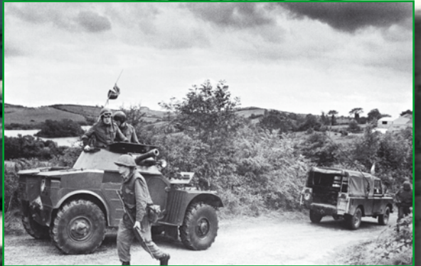
A Panhard AML 60-7 HB and a Landrover on a mobile patrol of the border about 1980.