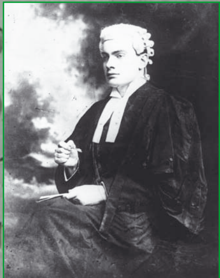
Pdraig Pearse, President of the Republic and Commander in Chief of its army during the 1916 Rising, who was executed on 3 May 1916.