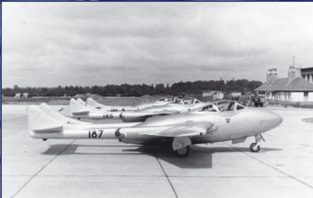
A line up of DH Vampires the first jet aircraft delivered to the Air Corps in 1955