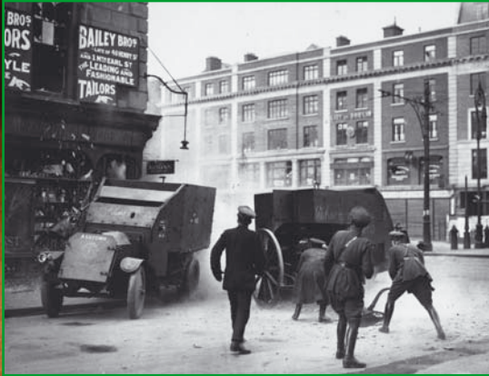
The National Army bombards Anti-Treaty positions in Dublin