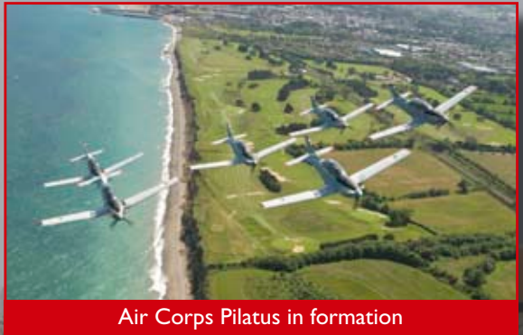
Air Corps Pilatus in formation