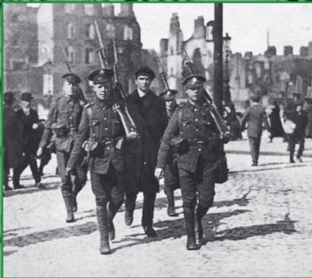
A Volunteer under armed escort after the Rising.