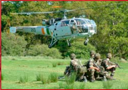
An Army/Air Corps exercise