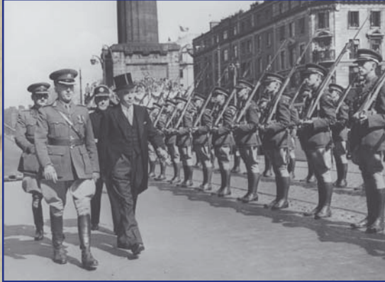
In April 1949 the Taoiseach, Mr John A. Costello, inspects a guard of honour of cadets to mark the passing of the Republic of Ireland Act 1948