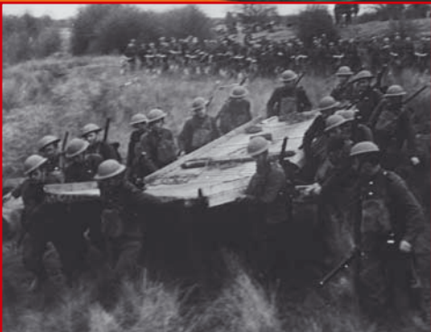
Engineers and Infantry about to launch an Assault River Crossing