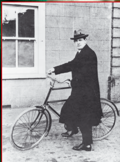
Michael Collins during the War of Independence.