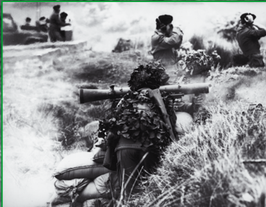
A Carl Gustaf 84mm Anti Tank Recoilless Rifle fires during a weapons shoot in the Glen of Imaal during the 1990s.