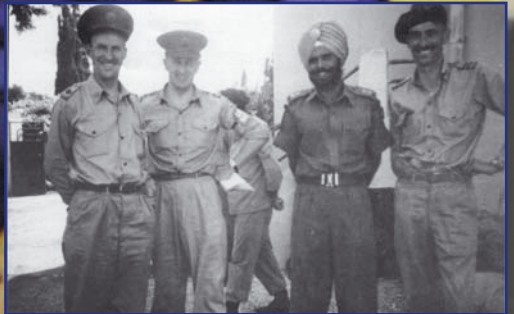
A group including three officers of the Defence Forces serving with UNOGIL pictured at Naquora in July 1958