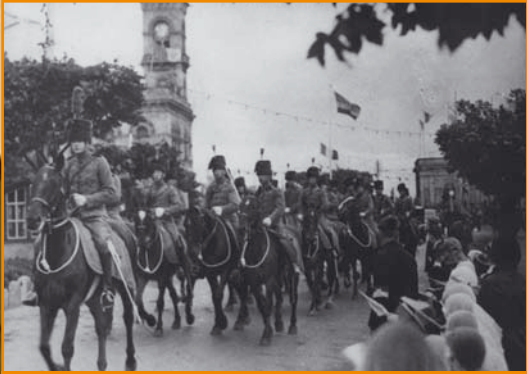
The Mounted Escort, popularly known as the Blue Hussars, parade for the first time in public during the Eucharistic Congress of 1932