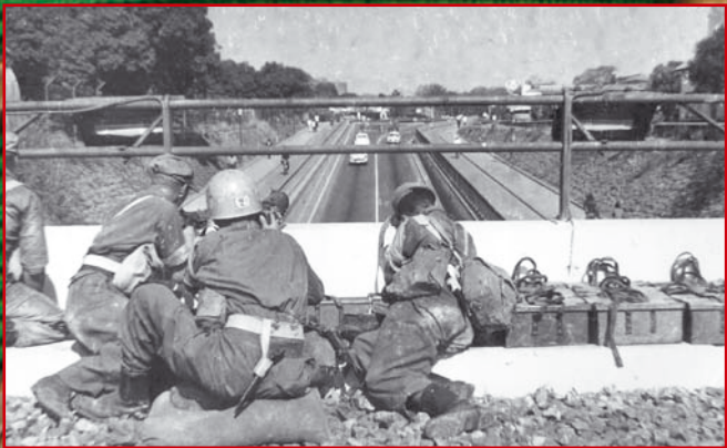
Members of 36 Bn manning a position over the Elizabethville road tunnel in the Congo in December 1961