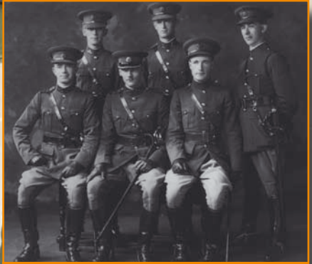
Members of the Volunteer Force, founded in 1934, parade through Dublin