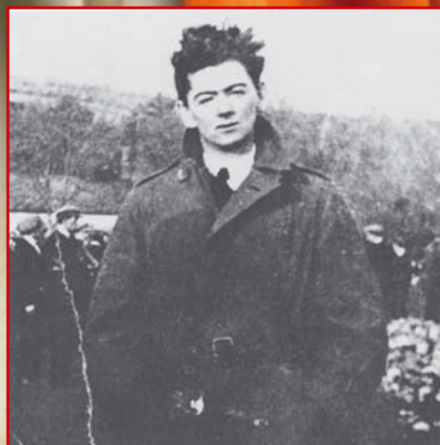
Tom Barry, Officer Commanding the Flying Column of the West Cork Brigade.