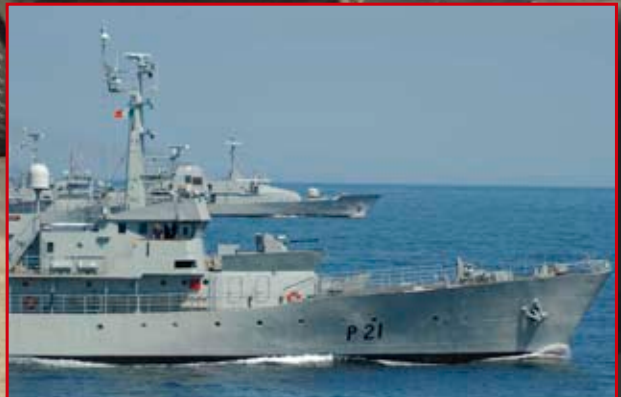
The Naval Service on patrol